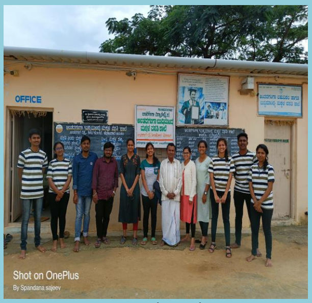
Antaraganga, Kolar Orphanage Visit